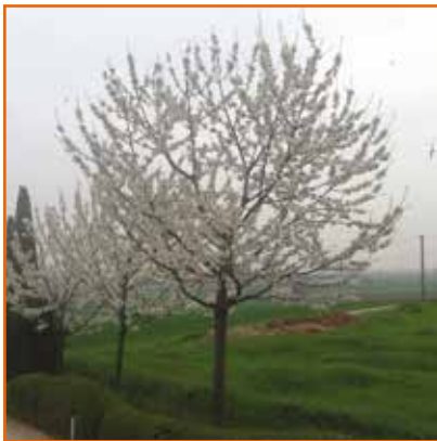
STANDARD TREE: Suitable for parks and tree-lined avenues or roads in the country.