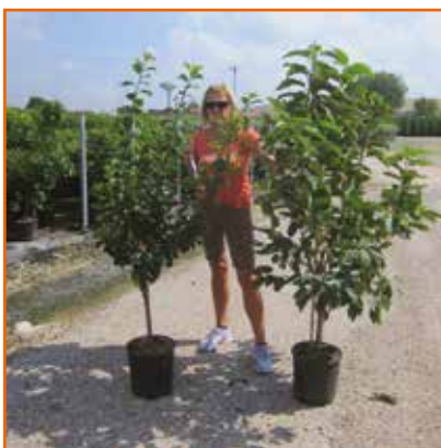
DWARF TREE: Suitable for terraces, balconies or small gardens.