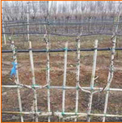
DOUBLE U CORDONS: Plants suitable for terraces, balconies or small gardens.