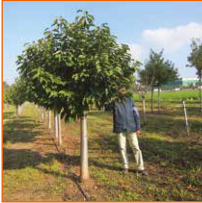
HALF - STANDARD TREE: Half-standard tree for the home orchard.